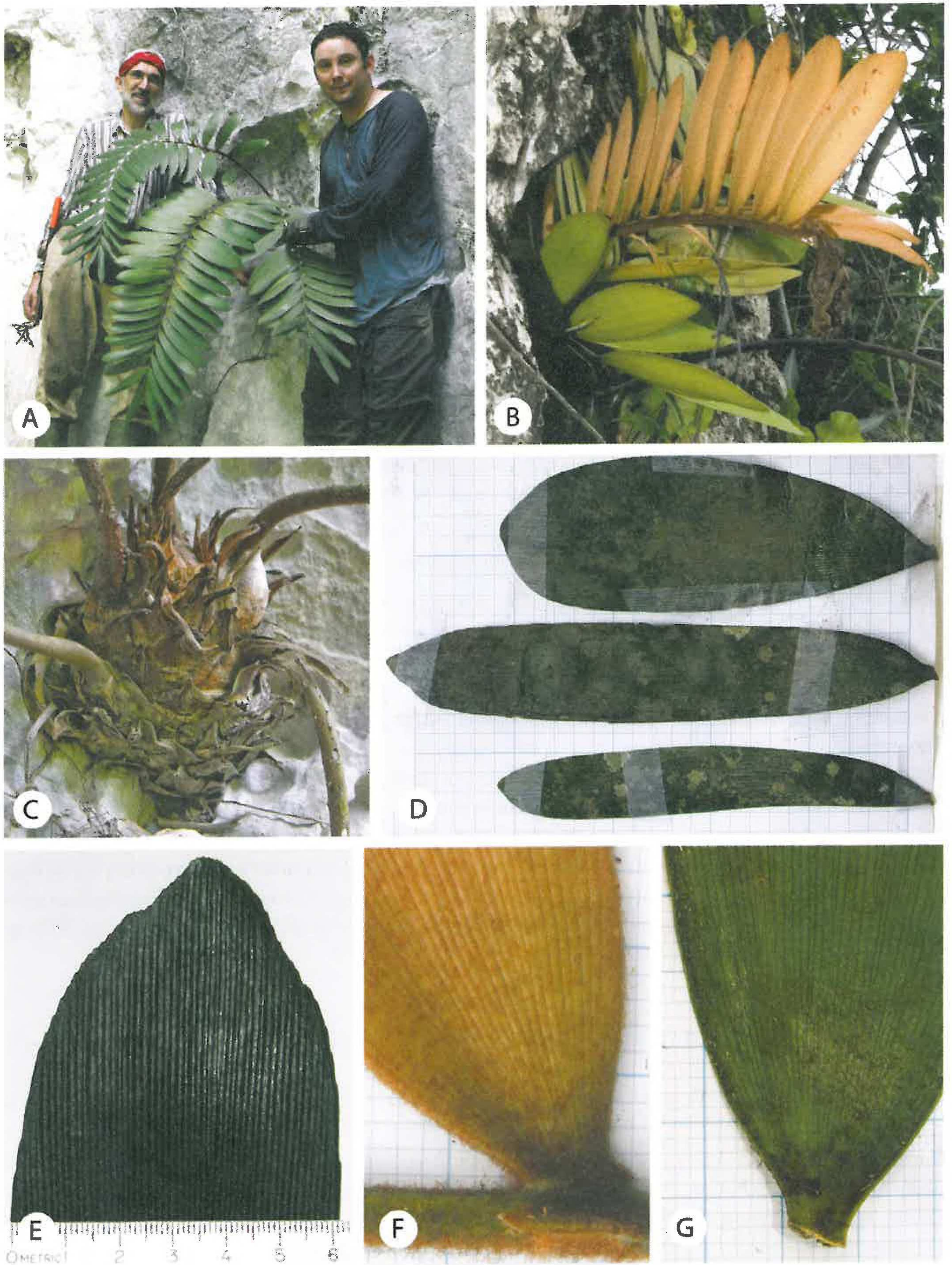
FIG.1. (A) Habit of plant, Jan Meerman on left, Michael Calonje on right. (B) Emergent leaf showing leaf damage by Eumaeus toxea herbivory. (C) Detail of trunk and petioles. (D) Variation in leaflet shape. (E) Closeup of apex on adaxial surface of leaflet showing raised veins and crenulate teeth. (F) Closeup of rachis and leaflet base of immature leaf showing distinctive orange tomentum. (G) Closeup of abaxial surface near leaflet base showing persistent tomentum on adult leaf. A and C represent Calonje et al. BZ08-152; B and F represent Calonje et al. BZ08-156; D, E and G represent Calonje et al. BZ08-125.